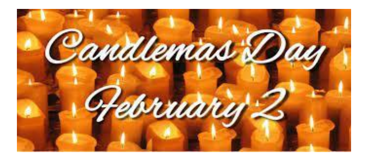
Candlemas ~ Friday, February 2<sup>nd</sup>, 2024 6:00 P.M. Holy Trinity No Noon Mass at HT

2024 Men's Conference. February 24<sup>th</sup>. Please see the cards in each parish for more information.